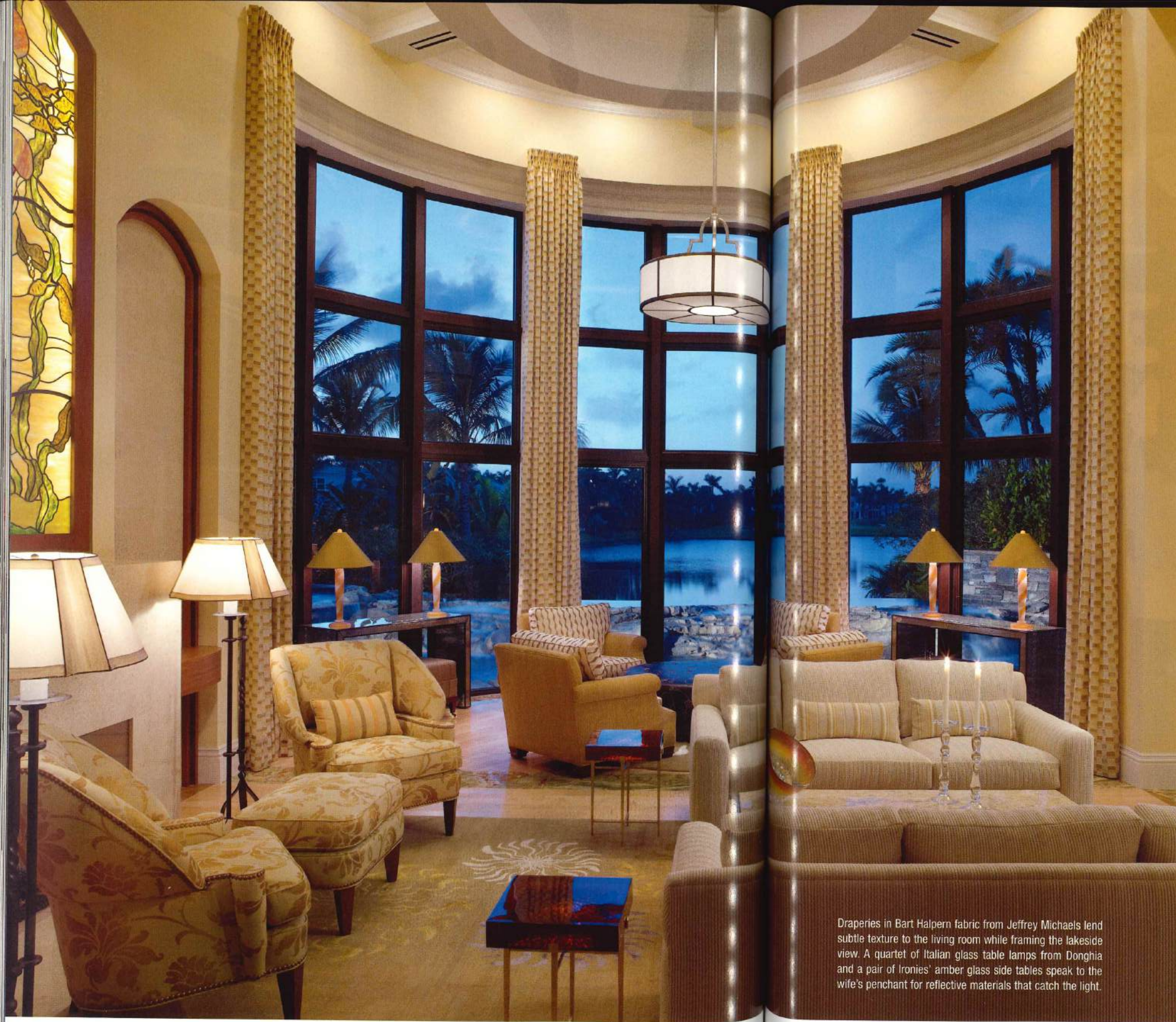
Draperies in Bart Halpern fabric from Jeffrey Michaels lend subtle texture to the living room while framing the lakeside view. A quartet of Italian glass table lamps from Donghia and a pair of Ironies' amber glass side tables speak to the wife's penchant for reflective materials that catch the light.